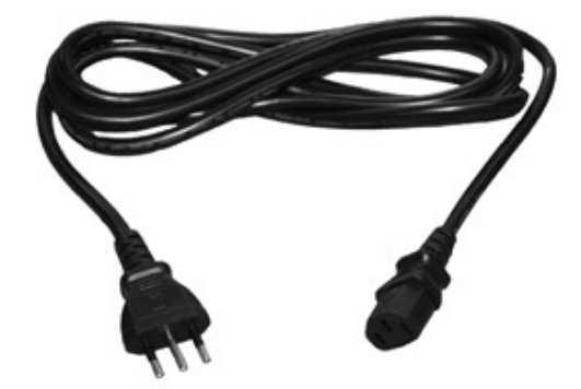
AC Power Cable, Denmark SKU: 9000091CABLE